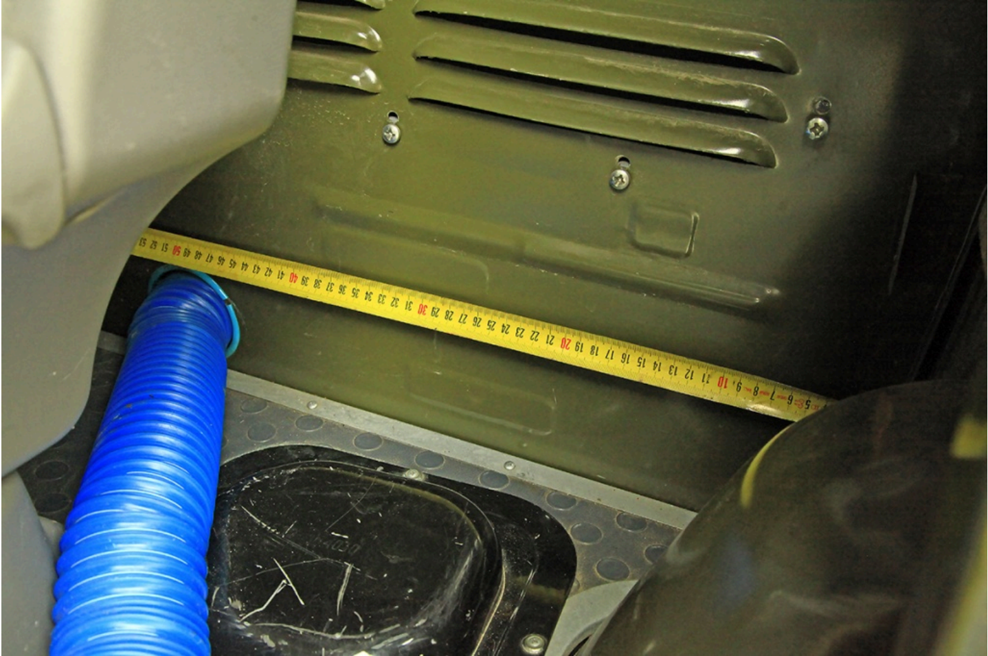
After reaming, process the metal edge and put a protective edge on it.