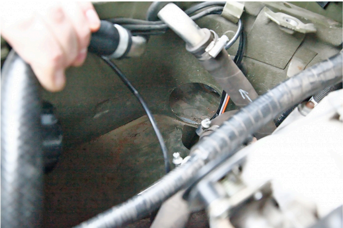
8. Pull the corrugated pipe first through the hole in the passenger compartment, and then through the hole in the engine compartment. Put on the yoke and fix it to the air filter housing.